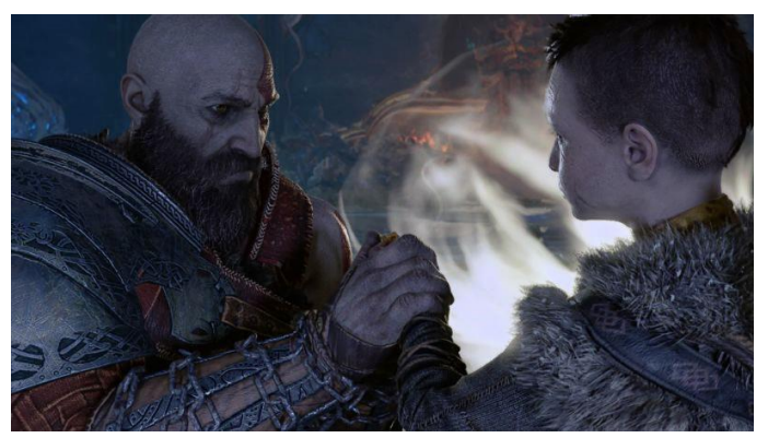
Figure 8: A moment of complicity between Kratos and Atreus in a dialogue about their journey

In the case of God of War , a more affective moment is visible between the characters Kratos and Atreus in a conversation regarding their journey (Figure. 8).