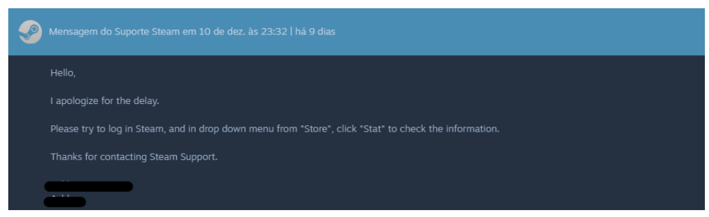
Figure 5: Response received from Steam support

only show the "best-selling games" and the "most played games", so it would be impossible to determine the variable of game completion.