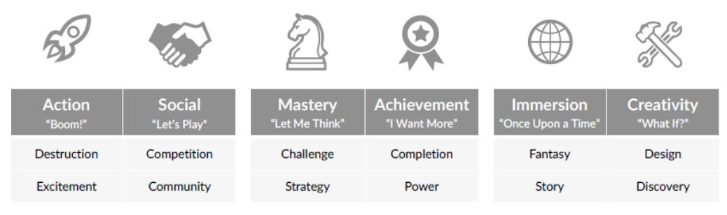
Figure 1: Motivational Model (Yee 2019)

In the 1980s, Malone and Lepper (1987) identified three categories of motivations that entice players to play: challenge, fantasy, and curiosity. This theory has been expanded to add other individual motivations such as: cooperation, competition, and recognition as interpersonal motivations. Day's (1981) through a preliminary review of the gaming literature realized that people were motivated to play games for reasons such as exploration and learning, creativity, therapeutic purposes, and entertainment, cited by Shu-Hui, Wann-Yih, and Dennison (2018). On the other hand, recently, Yee suggests the theory that players are motivated to engage in online gaming experiences through a combination of intrinsic and extrinsic rewards. Figure 1 exposes the motivation model by presenting six types of motivation: (1) action; (2) socialization; (3) mastery; (4) success or achievement; (5) immersion and finally, (6) creativity (Yee 2019).