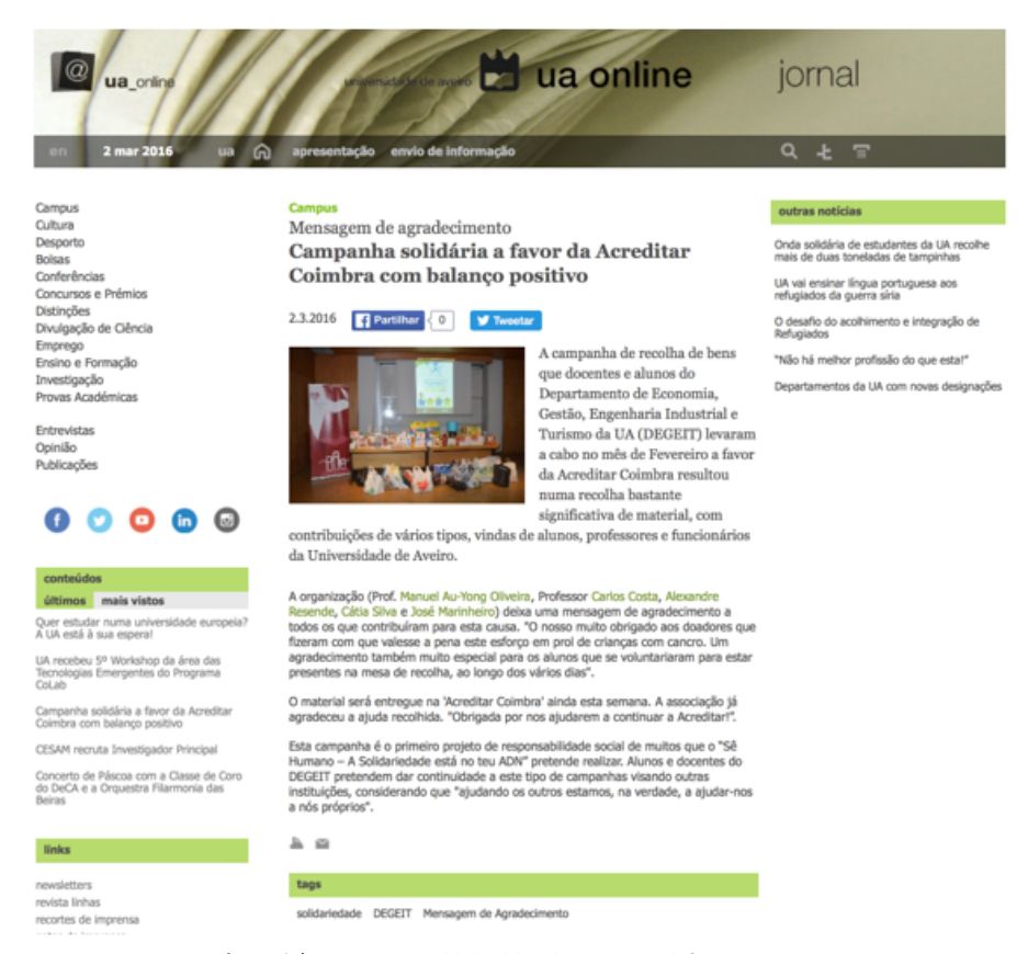
Figure 3 | News item published by the UA Jornal Online, in 2016

The increase in student activity related to social responsibility is a good indicator that DEGEIT is moving in the right direction.