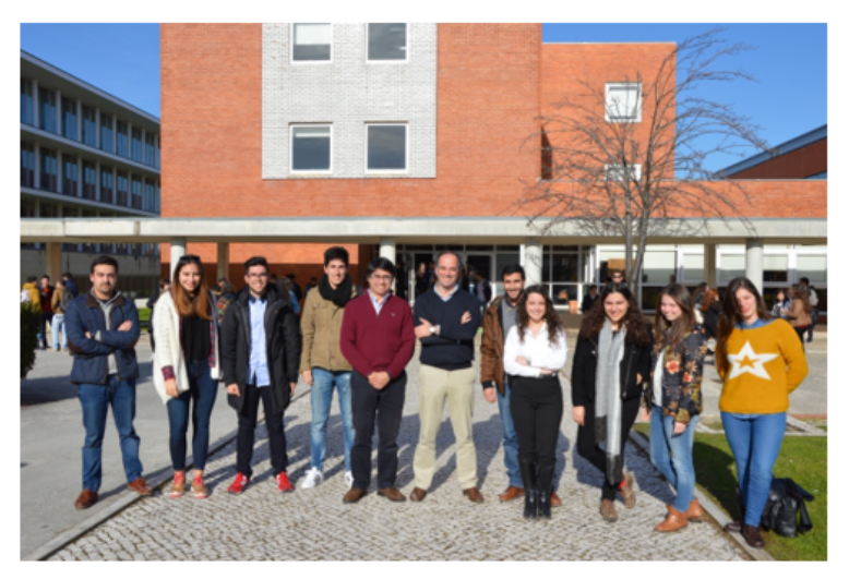
Figure 2 | Volunteers for a social responsibility project at the University of Aveiro (2016)

project with student volunteers - a project which gathered food, school materials, and health care products for a NGO (Non-Governmental Organization) - Acreditar Coimbra - providing aid for children with cancer and their families (figure 3).