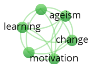
Figure 2 - A VOSviewer visualization n°2 of keywords - search done on Scopus on 21-11-2022 after a selection of the most relevant articles (x8) - search terms: "age" AND "leadership" AND "literature review".