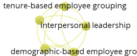
Figure 3 – A VOSviewer visualization n o 3 of keywords – search done on Scopus on 21-11-2022 after a selection of the most relevant articles (x8) – search terms: “age” AND “leadership” AND “literature review”.