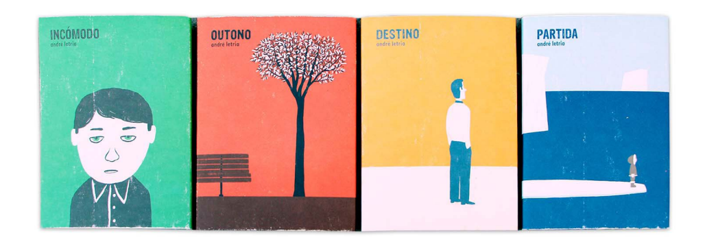
Fig. 4. André Letria's collection (slipcases) Sl. 4. Niz slikovnica Andréa Letrije (navlake za slikovnice)

In the case of André Letria's collection, each of the four books comes in its own envelope-like paper slipcase, which not only protects the fragile accordion book (it has no soft or hard cover), but also provides the title and all the indispensable information, such as the ISBN, the barcode, the publishing house and the date.