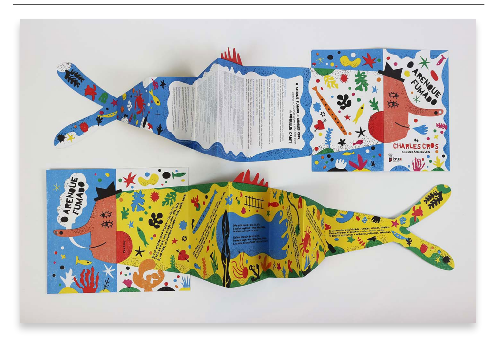
Fig. 2. O Arenque Fumado [The Smoked Herring] Sl. 2. O Arenque Fumado [Dimljena haringa]