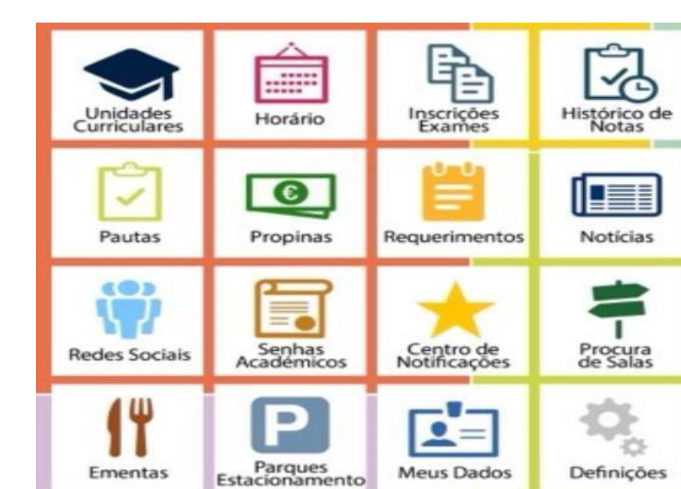
Fig.5 Main page of UA mobile

UA mobile (Figure 5) is an app that displays a multitude of information relevant to students, such as course enrollment status, class schedule, exam sign-ups, grades, tuitions, academic news or the canteen menu, among others.