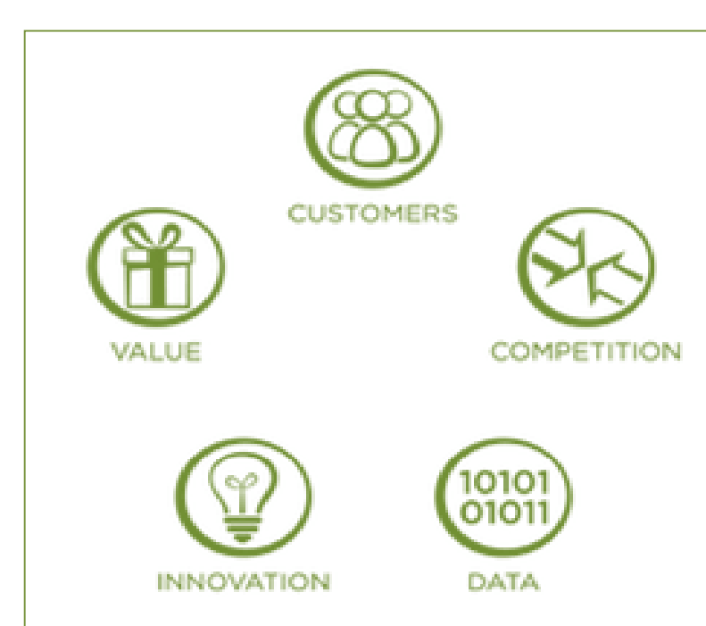
Fig.2 The five domains of digital transformation

For a successful DT strategy, literature suggests (e.g., Rogers, 2016) that it is necessary to acquire expertise in five pivotal areas (see Figure 2):