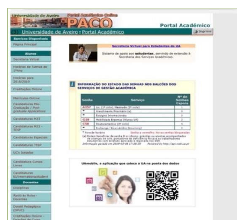
Fig.3 PACO

PACO is an academic portal with functionalities for students, faculty and administrative staff (Figure 3). Students can, for example, enroll in courses, sign up for exams or consult their schedule.