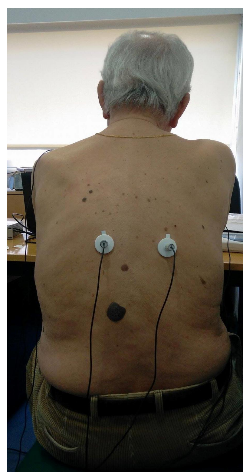
Figure 1. Respiratory sounds recording set up.

Respiratory sounds recordings were also repeated five to seven days after the first data collection, provided that the patient was stable in this interval (i.e., symptoms and medication remained unchanged).