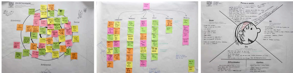
4. Examples of several exercises results

has not created consensus among the group. Tourism in the city has been growing proven by great economic development. Despite this this relevant public, the participants focused mainly on solutions for city residents and workers who walk every day through the streets of Porto, rather than on tourists.