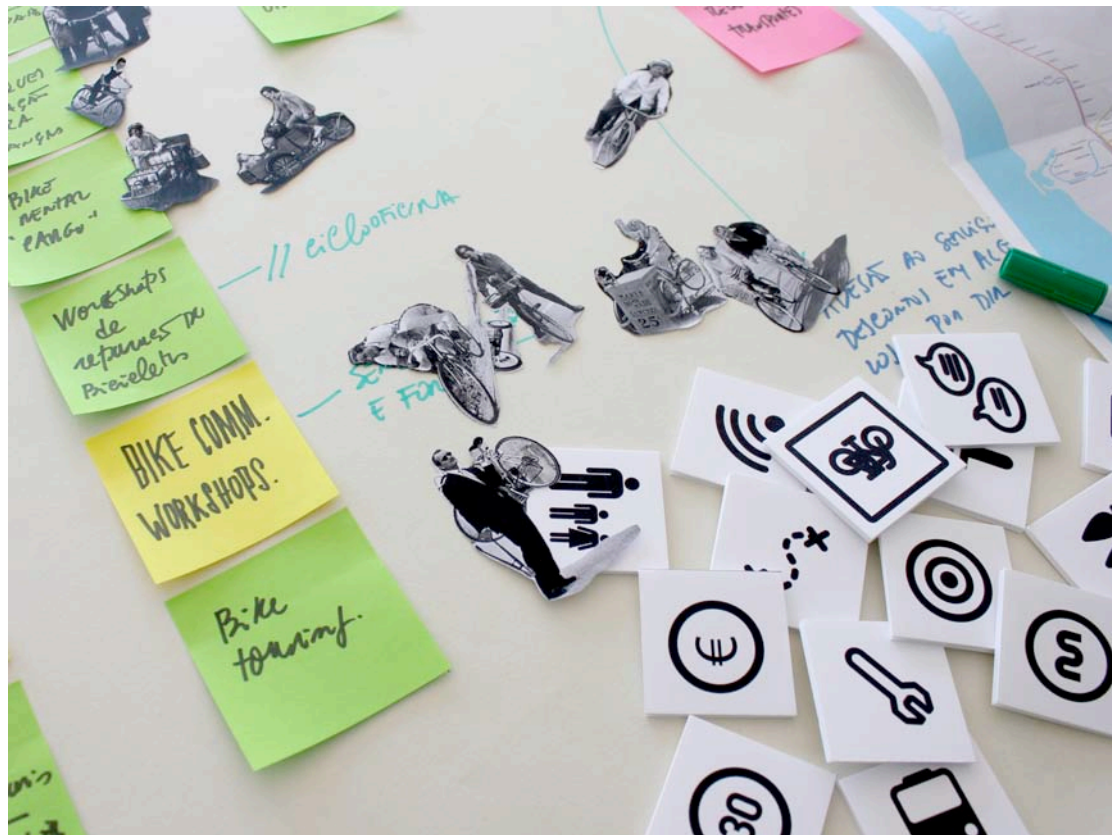
5. Experimental toolkit in action

With the momentum being created, a support was introduced, a toolkit composed of different film characters with bicycles, signage and a map of the city underground, in order to facilitate discussion and materialization of the concepts. This measure aimed to encourage a shift from a predominantly form of written and oral communication to a more graphic one.