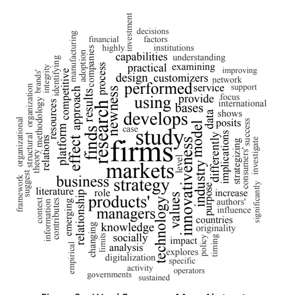
Figure 2 – Word Frequency Map: Abstracts

The results were no less than impressive: a total of 1.744 publications on the topic with an increasing trend since 2019. And we only looked at a five-year period. The most prolific author, Sacha Kraus, published 11 articles in this period and only from authors affiliated with the Copenhagen Business School, 31 articles have been published. As seen in Figure 1, Journal of Business Industrial Marketing published a total of 38 publications, followed closely by Strategic Management Journal (31 publications), Journal of Business Research (30 publications) and Industrial Marketing Management (29 publications).