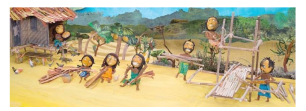
Fig. 5. Picturebook illustration technique

The technique chosen for the illustrations brings together three-dimensional elements using colouring and shading, cut-out and collage, creating scenes where the characters appear to move. These visual images help to create perspective with the use of greater definition and perceptions of depth and movement, as well as careful portrayal of lighting to show the shifting time of day. The use of vibrant colours and cutouts give particular emphasis to the local hues of the landscape, the flora and fauna, the architecture and the clothing and accessories, as well as the facial features of the characters.