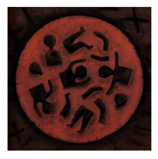
Fig. 2. Picturebook illustration

and oppressed. The ousting of the invading soldiers by the freedom fighters results in the slow and progressive return to the light after years of darkness. To represent this, the use of antonymic concepts is clear both from a chromatic and an illustrative point of view, with the shadows, night and death portrayed during the period of invasion and occupation and the dawn, light and the (sun)rise of liberty metaphorically connected to freedom and self-government, all of which clearly overlap with national Timorese identity.