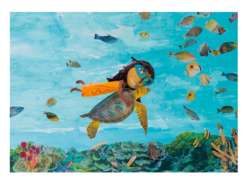
Fig. 6. Picturebook illustration example

The technique chosen for the illustrations brings together three-dimensional elements using colouring and shading, cut-out and collage, creating scenes where the characters appear to move. These visual images help to create perspective with the use of greater definition and perceptions of depth and movement, as well as careful portrayal of lighting to show the shifting time of day. The use of vibrant colours and cutouts give particular emphasis to the local hues of the landscape, the flora and fauna, the architecture and the clothing and accessories, as well as the facial features of the characters.